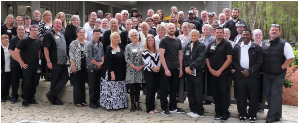
Sheriffs Ranches Enterprises at the 2018 SRE Employee Appreciation Day.