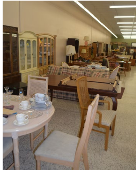
Household furniture on the floor at Thrift Store Dunedin.

Demonstrated every day through personal responsibility of doing the right thing at the right time for the right reasons.