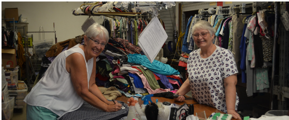
Volunteers sort through clothes at the Leesburg Thrift Store.