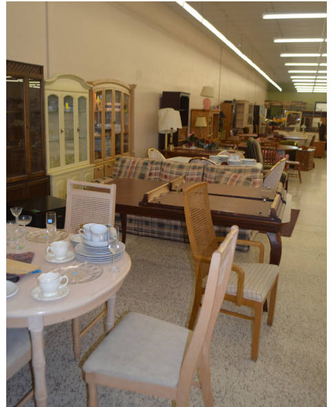
Household furniture on the floor at Thrift Store Dunedin.

Demonstrated every day through personal responsibility of doing the right thing at the right time for the right reasons.