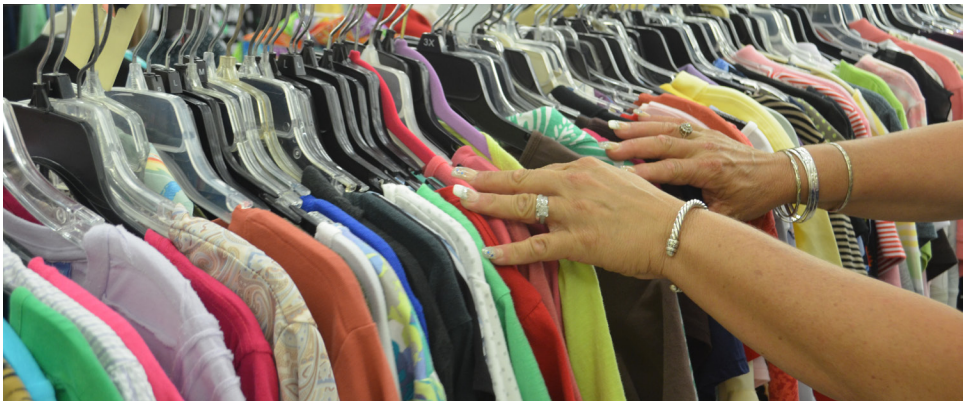
An employee at the Spring Hill Thrift Store organizes and arranges clothes on a rack.